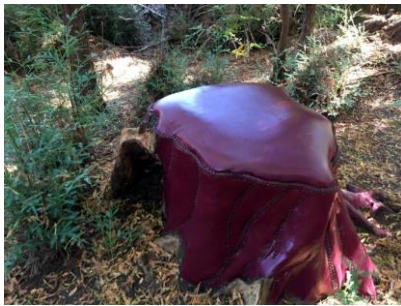
Roots to Crown, Alissa Neglia, 2006