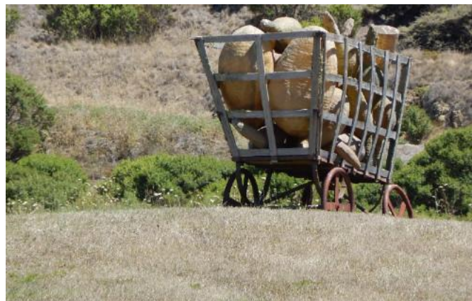
To Market To Market, Weber and Wareham (2000).

Is it just me or is the exponentially increasing nastiness on the news dinner plate each night wearing heavily on your soul? Nothing is more unconsciously contagious than negativism and nastiness. The twitter outrage of the month has given way to the twitter outrage of the DAY. I have only two minutes a day for "ain't it awful," (a longstanding rule of mine) but it's getting harder and harder to maintain. I have